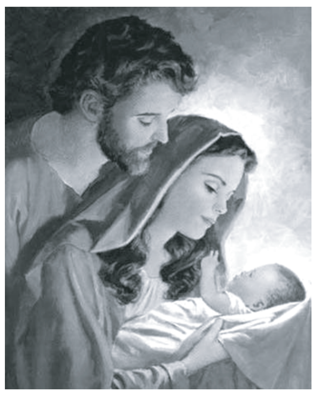
Feast of the Holy Family

Tel: 416-261-5983 Fax: 416-261-5973 Email: stbonifacesc@archtoronto.org Web: stbonifacesc.archtoronto.org