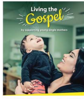
SHARELIFE SUNDAY COLLECTIONS September 13 / October 11 / November 1